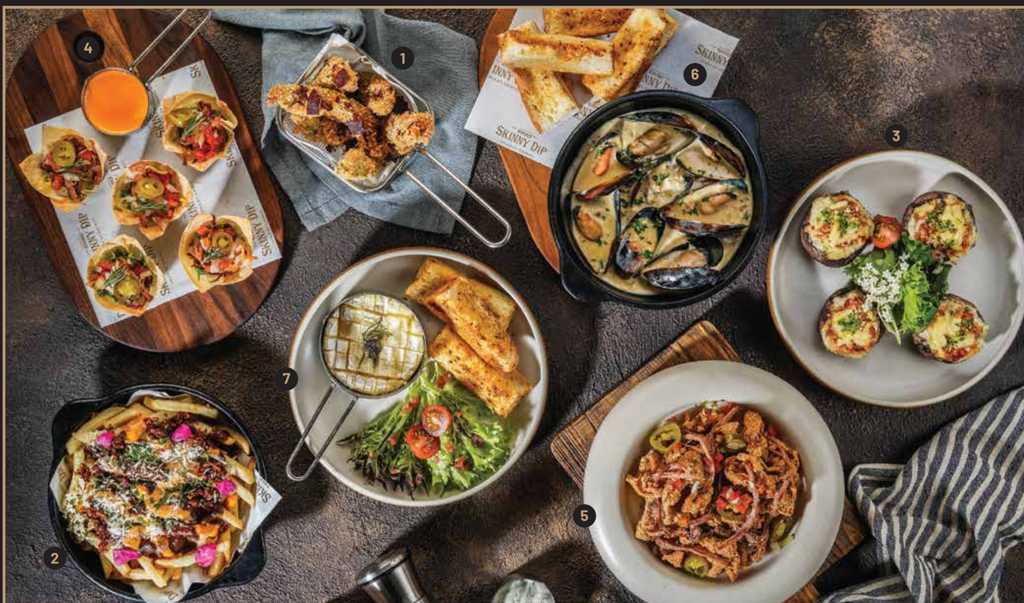
1 Avocat Frites